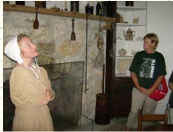
Inside a New Salem home