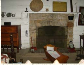
This was one of the finest homes in New Salem