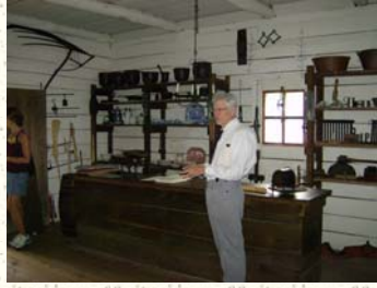
The second Lincoln Berry Store