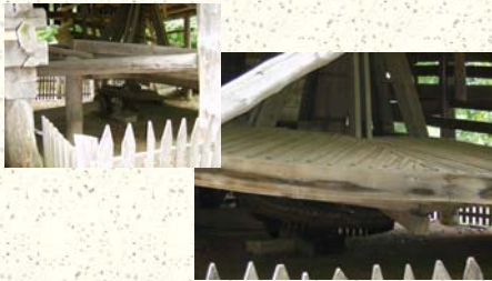
At the Carding Mill