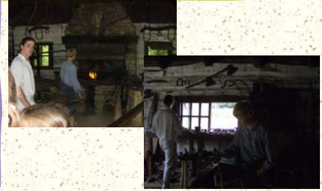
In the Blacksmith's Shop