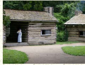
Another New Salem Home